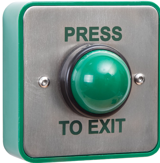
Request to Exit Button