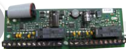
12-0109-EN: Extension card for the 2-door central unit (03-0101-EN)