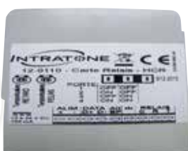
12-0110-EN: Relay card for the 1-door central unit (03-0102-EN)