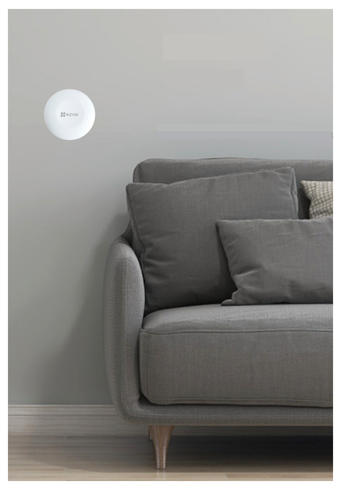
Fig. 2 Stick at where you want