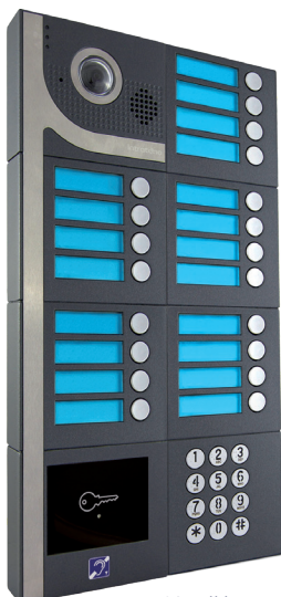
20 call buttons