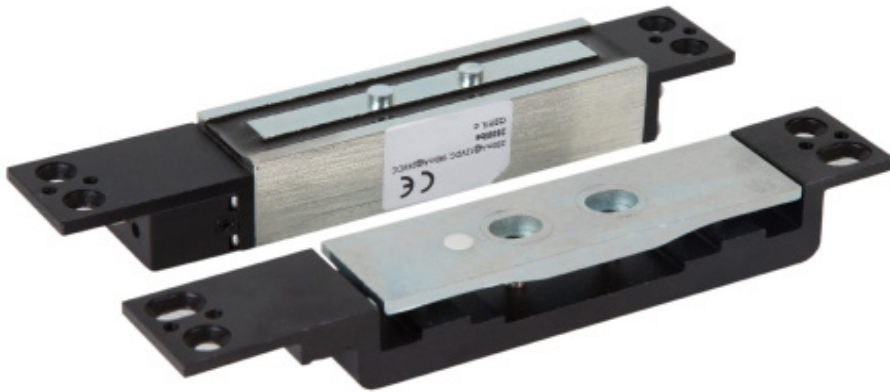
Shear Lock (2600lb)