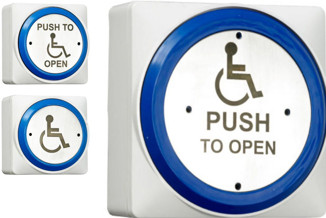
Push Plate DDA Exit Button