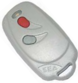
Smart Dual 2 channels