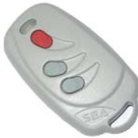
Smart Dual 3 channels