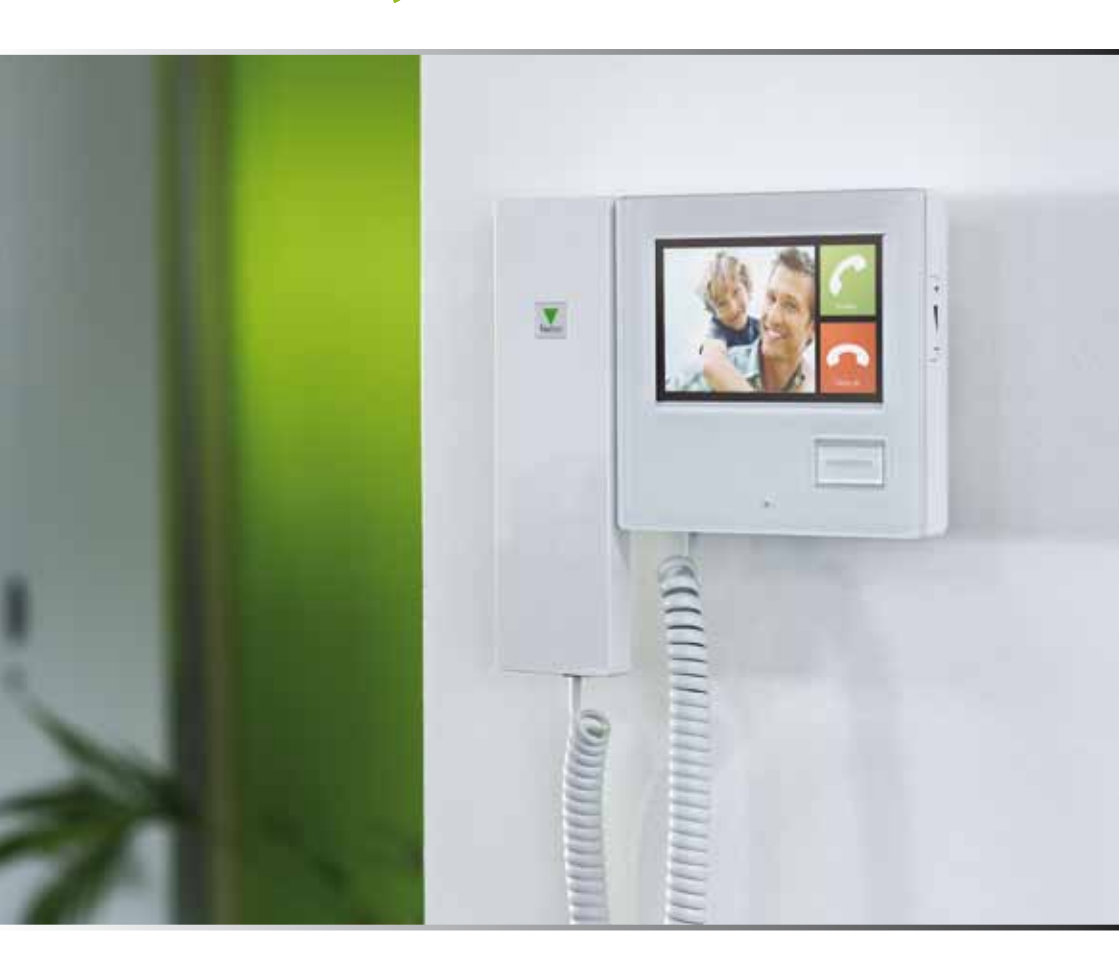
Demo case - Quick start guide